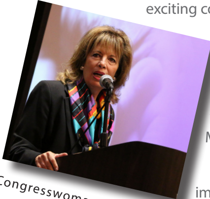
Congresswoman Jackie Speier