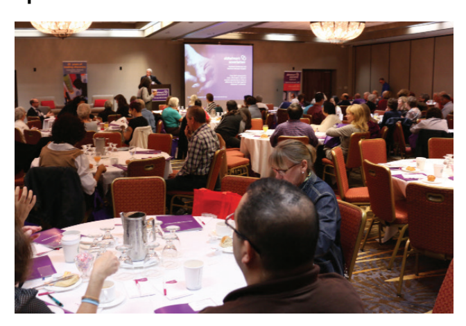
2014 Alzheimer's Association Conference

Join our Field Ombudsman for the 17th Annual Updates on Dementia Care Conference: Translating Research Into Practice on Wednesday, May 13, 2015 at the Crowne Plaza Foster City. We will examine the latest research in the biological, social, and psychological aspects of aging and dementia with particular emphasis on work that will have practical applications to clinical practice.